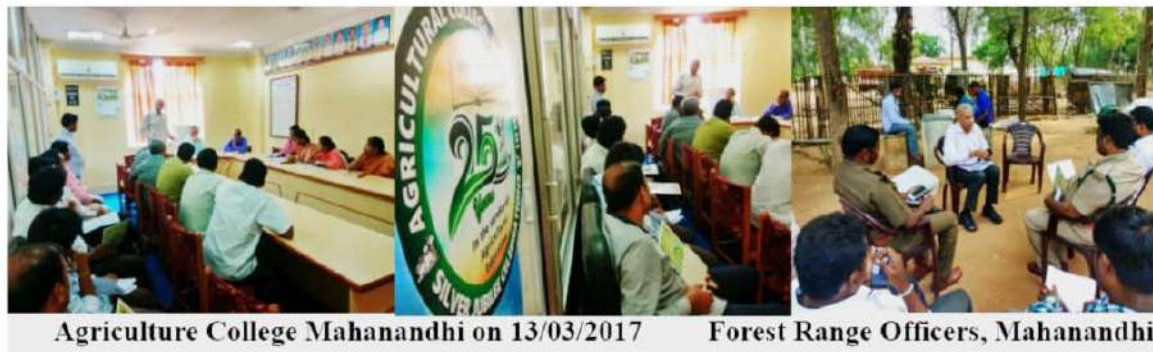
Agriculture College Mahanandhi on 13/03/2017

The Mahanandi declaration throws light on the tremendous thought processes of Literature and treasure of knowledge in-line with United Nations and beyond 2045 Vision to shape better policies for better life of human well-being. Further, this declaration shall be documented with scientific methodology which is evident through papers in different streams with cross country research analysis on a comparison of resource content while executing at our upcoming / ongoing corridor projects of Asia Pacific research station Mahanandi, Africa and Europe. Many conventions and declarations like Geneva etc. are established by our member states, but this content shall show case activities in line with focus on the future. Finally, this document shall remain before member states as communication on the commonalities in the larger interest of the globe.