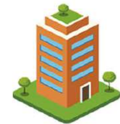
Asia Pacific Research Station

Dialogues has been initiated for the past 5 years from local to global stake holders with a caption 'Strong Together- Build The Nations through scientific methodology' In line with UN framework